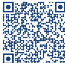
Find us on Spotify!

Series: Easter 2026 – Follow Me Sermon: Thursday – Into the Garden Scripture: Mark 14.32-42